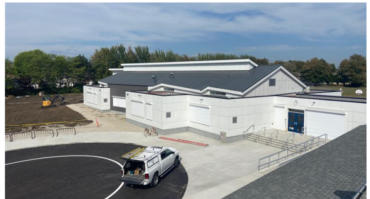
$6,800,000 Mitchell Elementary School Seismic & Addition

The heritage restoration of a 2 storey, 1914 wood frame and concrete foundation school to convert it to the district's administration building. Work includes the repair and restoration of the original wood windows, front entry façade, porch and gable roof, the restoration and refinishing of the shiplap exterior cladding as well as the installation of a new Cupola (bell tower). The project also includes a new 2,633 m 2 2 storey addition with underground parking and associated site development.