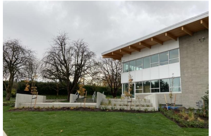
$12,000,000 Burnaby School District Administration Office

The heritage restoration of a 2 storey, 1914 wood frame and concrete foundation school to convert it to the district's administration building. Work includes the repair and restoration of the original wood windows, front entry façade, porch and gable roof, the restoration and refinishing of the shiplap exterior cladding as well as the installation of a new Cupola (bell tower). The project also includes a new 2,633 m 2 2 storey addition with underground parking and associated site development.