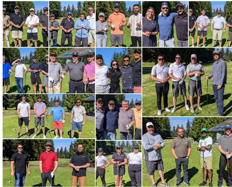
All 14 Golf Squads about to tee off.